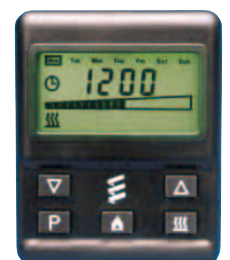
7 Day Digital Timer Modulator